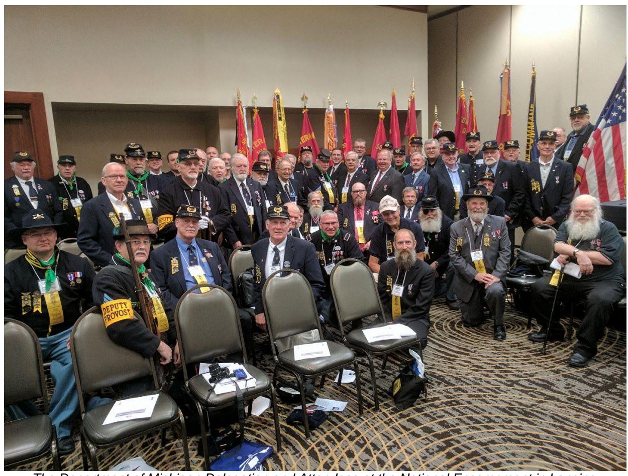
The Department of Michigan Delegation and Attendees at the National Encampment in Lansing