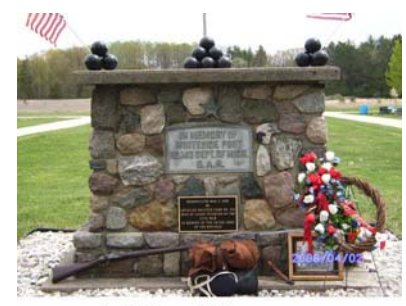
Rededicated Monument to Whiteside Post #143, GAR

On May 30 the Camp conducted a very moving Decoration Day ceremony at the GAR Memorial to the Lonson Post #255 in Fremont Cemetery near Mayville, MI. Later, we traveled to Caro where we observed Memorial Day with the American Legion Post #7 and VFW Post #4164, both of Caro.