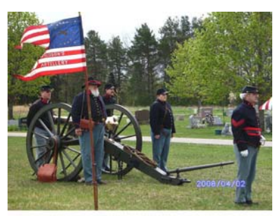
2nd Michigan Hudson Artillery