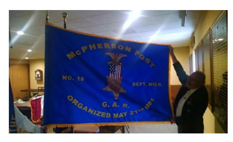
Camp 14's new flag