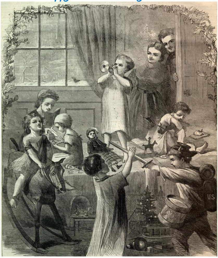
Christmas Morning by Thomas Nast, 1864