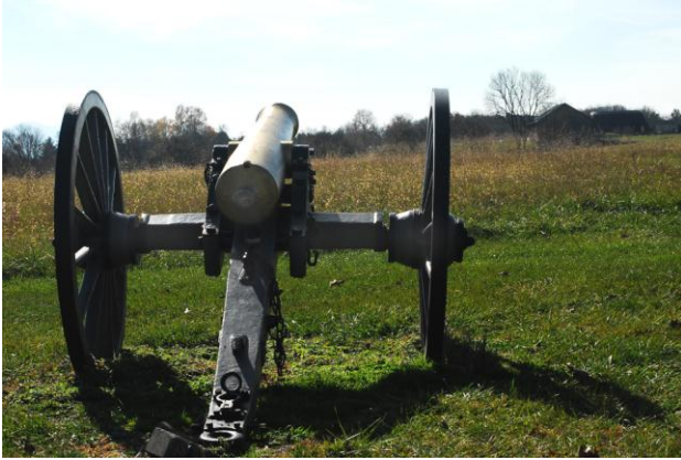
New Market Field of Lost Shoes