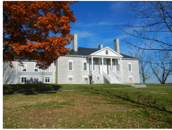
Old Court House and Museum Winchester, Virginia