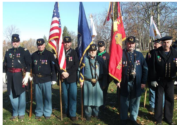
14 th Michigan, Co. A, SVR Color Guard at Woolson Memorial Service

Following the parade, the 14 th Michigan, SVR traveled to the 7 th Michigan Infantry's monument near the Copse of Trees where they performed a memorial service for the men of the 7 th who fought there.