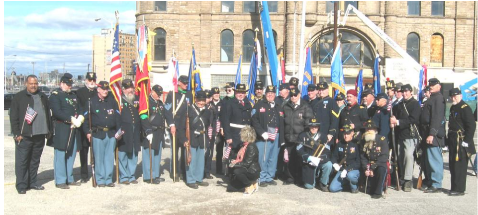
Department of Michigan and SVR at Flag Raising Ceremony at G.A.R. Hall in Detroit, Michigan, November 3, 2012

On November 3 rd they participated in the Veterans Day Parade in Detroit. Following the Parade, there was a special flag raising ceremony at the Detroit G.A.R. Hall which is in the process of being fully and historical restored in the areas utilized by the G.A.R. members who once called the hall their home.