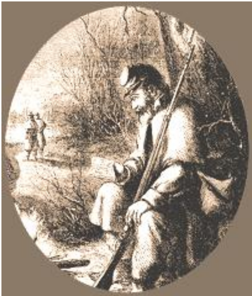
“Christmas Eve” 1862 Harper’s Weekly

Recipient of the Marshall Hope Award for Best Department Newsletter of the Order 2002, 2007, 2011