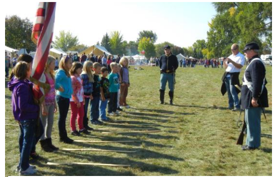
Grant Camp Brothers conducted a School of the Soldier and basic drill for Education Day students

Grant Camp Brothers were also busy during the Education Day teaching School of The Soldier and basic drill to students ranging from elementary age up to high school. Approximately 3,000 to 4,000 students attended the Education Day. Many of the older students were tasked by their teachers with obtaining a variety of information and facts about the Civil War as part of their history assignments.