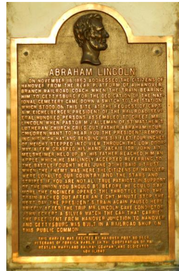
Dedication Marker of Lincoln's speech prior to Gettysburg Address, Hanover, Pennsylvania