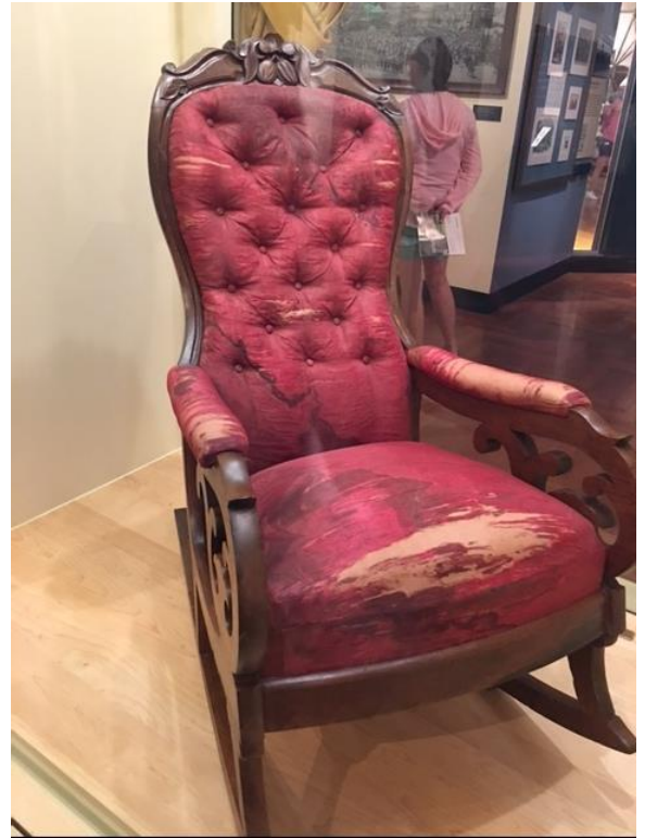
Lincoln's chair from Ford's Theatre

chair that President Abraham Lincoln sat in at Ford's Theatre the night he was assassinated.