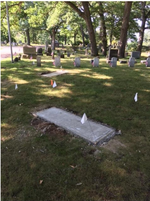
Concrete bases looking south

Some evidence of the movement of the monument can be seen in the pad that surrounds the base. Movement is the greatest on the north side where the base has move by as much as five inches from the west base (see below photograph).