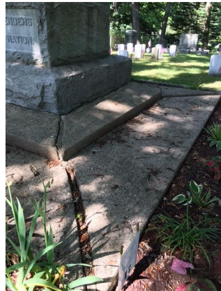
3" crack in monument base NE side and 5" on NW side

A recent inspection of the GAR Monument in Riverside Cemetery suggests that the monument is leaning 2 to 3 degrees to the north. If this is accurate, it is probably not enough to damage the monument as yet. Usually a tilt of 5 degrees or more is considered the level where the stress caused by the tilt could begin to damage the stone.