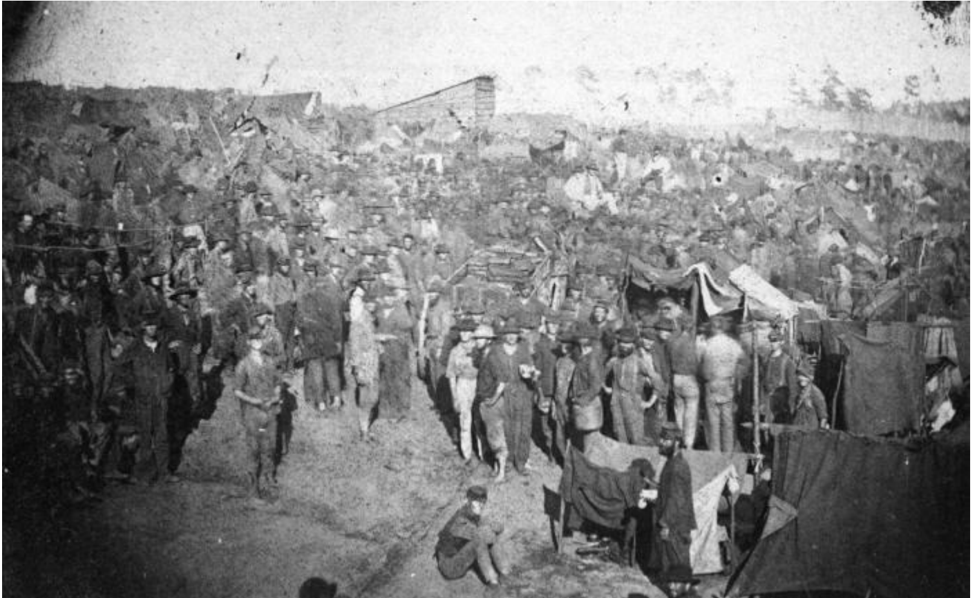
Union prisoners receive rations at Fort Sumter in 1864