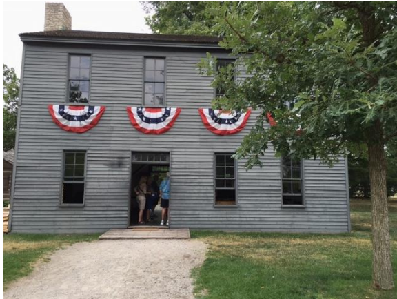
Logan County Illinois Courthouse (circa 1840)

The courthouse, Thomas Edison's Menlo Park laboratory, and many other important historical buildings were disassembled and moved to Greenfield Village.