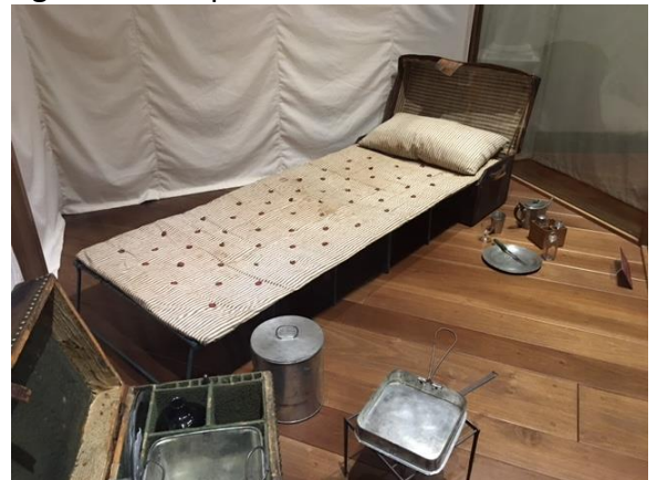
U. S. Grant's travel cot

General U. S. Grant used the travel cot below when he was in the field commanding the Union Armies. It folded up into the trunk at the right for transport.