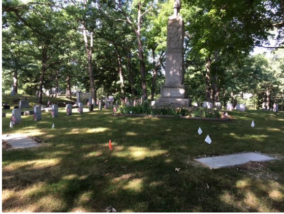
Concrete bases viewed from the road in front of the monument