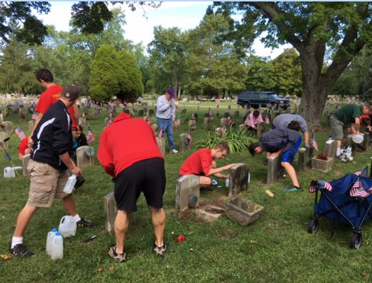
All Scout volunteers working diligently to clean and repair veteran gravestones