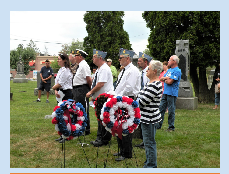
American Legion Post 297 and Sons of American Legion. Also participating were the SUVCW of IN Camps 116 & 117, SUVCW of MI Camps 20, 85 & 135 as well as the Mich.14th and the Ind.27th SVR