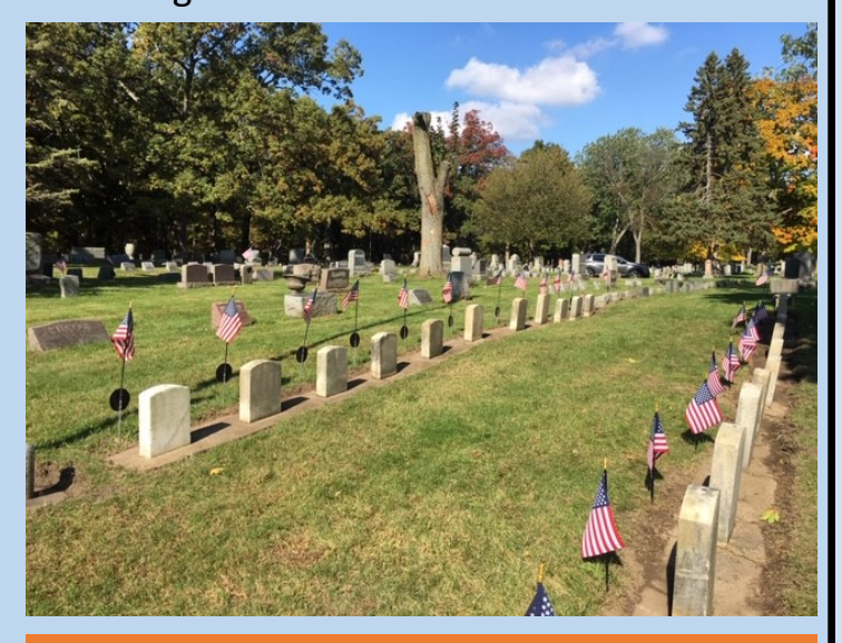
All graves were provided with flag holders and new or refurbished flags