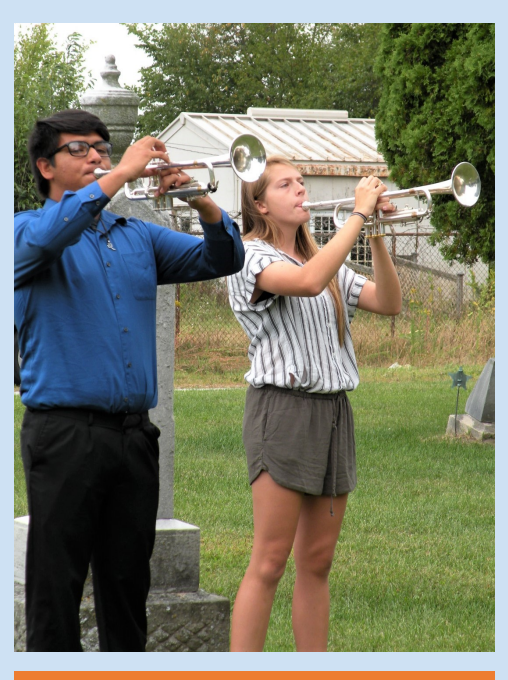
Taps played by student musicians from New Prairie High School