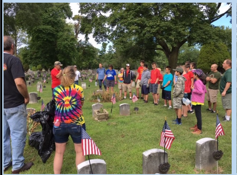
Portage Troop 244 during training

Josh was successful in recruiting approximately 20 volunteers including other scouts in his troop plus parents and leaders. They learned a great deal about the proper care of veteran gravestones and made significant progress towards the preservation of the veteran gravestones.