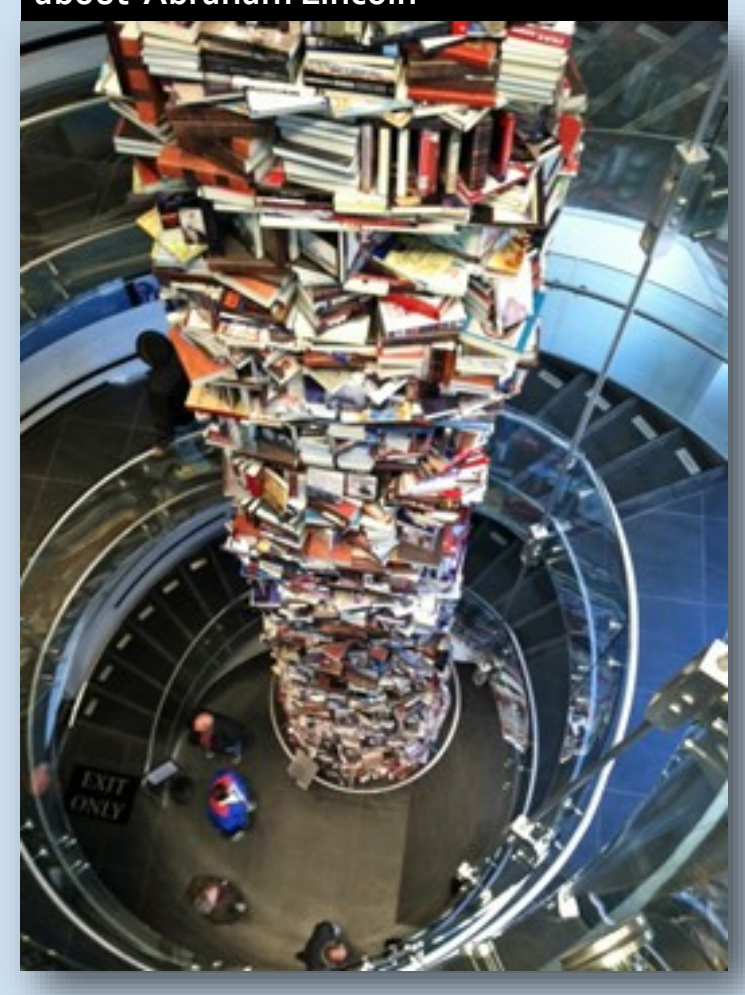
Photo of a 34 foot tower containing less than half (6800) of the books written about Abraham Lincoln

The number of books that have been written about Abraham Lincoln. That's more books written about a single person except Jesus Christ.