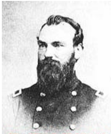
GEN. BENJ. D. PRITCHARD

SEPTEMBER 2008 THE PRITCHARD PRESS NEWSLETTER OF THE GEN. BENJAMIN PRITCHARD CAMP 20 DEPARTMENT OF MICHIGAN SONS of UNION VETERANS of the CIVIL WAR "PRESERVED BY THE GRACE OF GOD..."